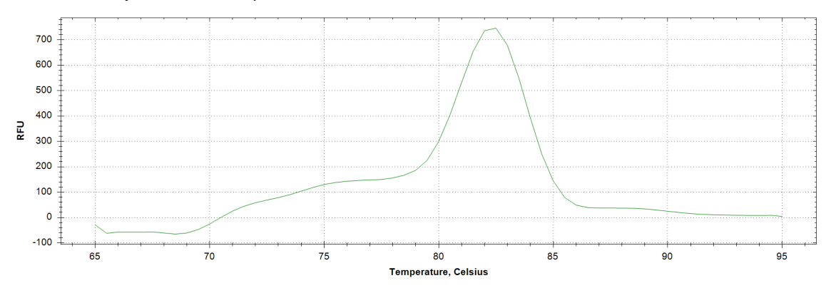
Melt curve analysis of above amplification