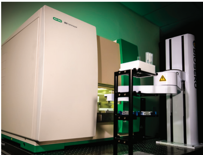
The ZE5 Cell Analyzer integrated into the Biosero Automated Plate Handling System.

The ZE5 Cell Analyzer was built for high-throughput analysis with a focus on speed, flexibility, high-parameter analysis, and automation. The integrated sample loader is able to accommodate tube racks, 96-well plates, or 384-well plates. Screening is fast, with the ability to analyze up to 100,000 events per second. In high-throughput mode, a 96-well plate can be analyzed in less than 15 minutes and a 384-well plate in less than 60 minutes. In addition to its speed, the ZE5 Cell Analyzer can accommodate up to five lasers and 30 detectors, giving it the ability to simultaneously detect 27 fluorescence parameters. Consideration for sample integrity is also built in, with temperature control and vortexing available to keep cells viable and uniform during sampling. The ZE5 Cell Analyzer features flexible capabilities for use in a wide range of applications that can be improved with high-throughput automation.