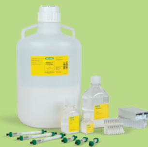
Process purification bottles, columns, and plates.