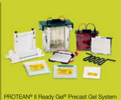
PROTEAN® II Ready Gel® Precast Gel System