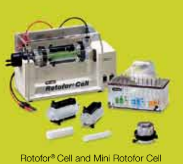
Rotofor® Cell and Mini Rotofor Cell