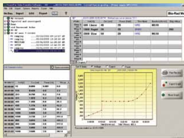
IEF separation with voltage ramping.