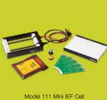
Model 111 Mini IEF Cell