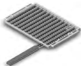
Fig. 2. Removal of ProteinChip arrays from cassette using array forceps.