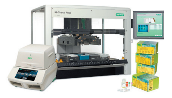
iQ-Check Prep, CFX and kits

Forty-eight untreated spice samples were collected and aseptically weighed into 25g portions for testing and artificially contaminated with Salmonella Abaetetuba ATCC 35640 lyophilized pellets. The lyophilized pellets containing the inoculum culture were dissolved in 10 ml of distilled water and tested for inoculum level. Pellets used contained approximately 695 cfu/pellet and was calculated that 160–200µl was necessary to spike a sample with 10–15 cfu/bag. The Salmonella strain was added to the spice samples in BPW within 15 minutes after dissolving the pellet.