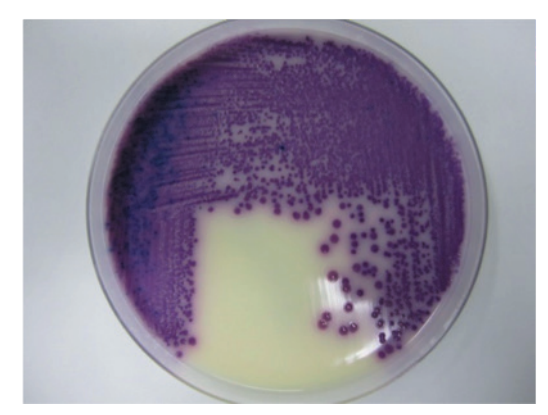
Image 2: Salmonella culture from Cinnamon Sample 3 after enrichment in BPW + inhibitor neutralizing additive