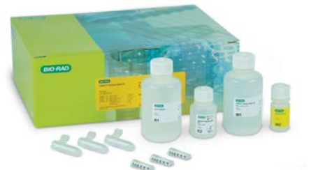
VINEO Extract DNA Kit