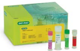
VINEO ZYGO bailii Kit

Visit us on the web at bio-rad.com/web/VINEO for more information.