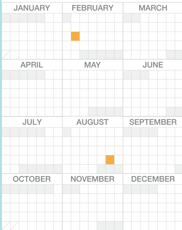
D-100 System — SMART HPLC