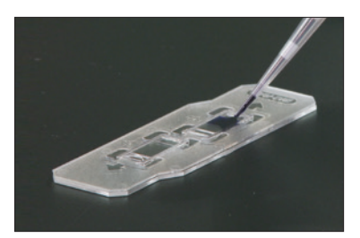
Fig. 1. Loading the sample onto a slide.