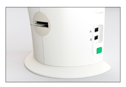
Fig. 2. Inserting the slide into the TC20 Cell Counter; counting automatically begins.