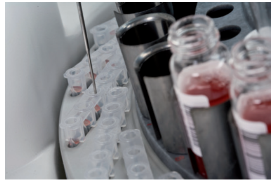
Pipetting of ID-Cards

Following the given test protocols precisely, Swing standardizes the cell suspensions and the pipetting volumes.