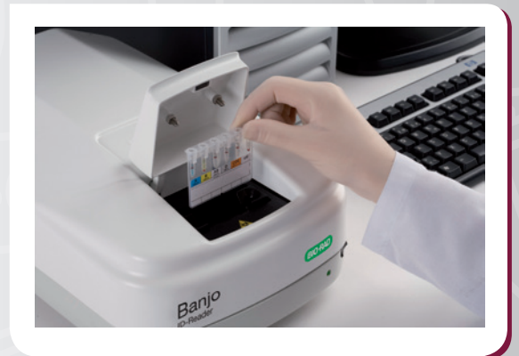
Inserting an ID-Card

The database allows you to archive data and group or search it using different criteria, thereby ensuring the integrity of allocated results.