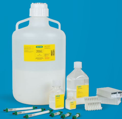
Bottles and Foresight™ Columns, Plates, and RoboColumn Units