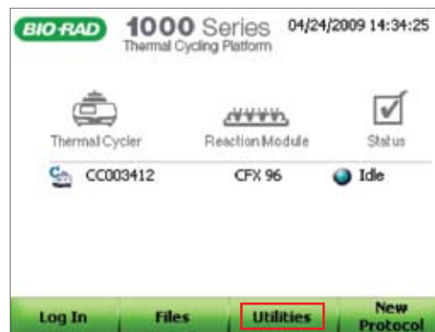
Fig. 1. Main menu in the front panel of the C1000 thermal cycler.

Note: The firmware version listed at the top of the instrument screen corresponds to the firmware version listed as PXA270 on the website. The FX2, 8051, and DSP firmware are only used for real-time PCR. If you are using a C1000 thermal cycler for standard PCR, these firmware versions will be listed as “NA” in the front panel of the instrument and you do not need to update them.