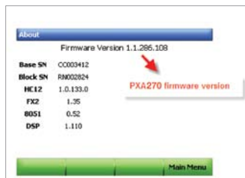
Fig. 3. Installed firmware version displayed on the C1000 thermal cycler.