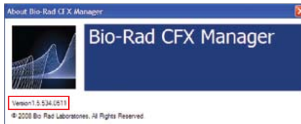
Fig. 5. Installed software version displayed in the About Bio-Rad CFX Manager window.

Notice regarding Bio-Rad thermal cyclers and real-time systems: