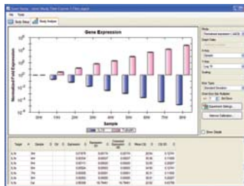
Multifile gene expression analysis. Compare C_T values from different data files using the Gene Study module in CFX Manager software.