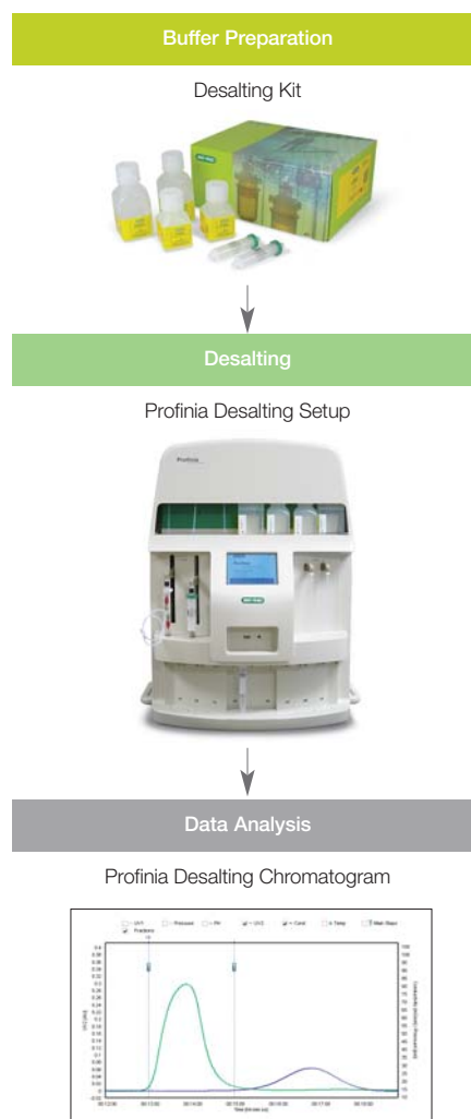
Fig. 1. Workflow from protein sample to desalted protein using the Profinia system.

Bovine serum albumin (BSA) fraction V (Sigma-Aldrich) was dissolved in 300 mM KCl and 50 mM potassium phosphate to a final concentration of 3 mg/ml in preparation for desalting. A 2 ml sample and a 10 ml sample were then desalted using the Profinia system or by dialysis. The progress of desalting was followed by measuring sample conductivity, and protein concentration and yield were determined spectrophotometrically using the sample absorbance at 280 nm and the known absorbance of a 1 mg/ml BSA solution. Three desalting runs were performed with each method.