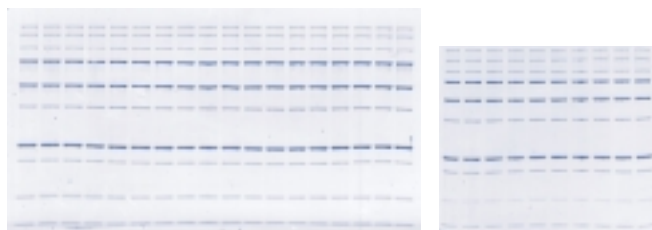
Criterion XT Gels Separate More Samples: Demonstrated by Bio-Rad Precision Plus Protein™ standards separated on a Criterion XT 12% Bis-Tris gel (left) and the leading competitor's 12% Bis-Tris gel (right).