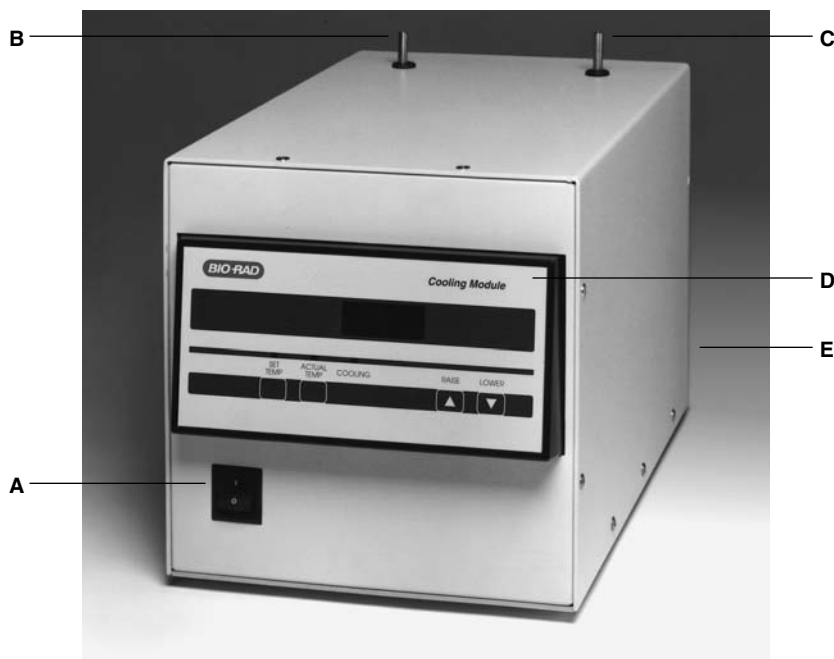
Fig. 1. Cooling Module. A. Main power switch. B. FLOW IN port. C. FLOW OUT port. D. Control panel. E. Electrophoresis chamber internal temperature probe port and fuse (back of unit).

The Cooling Module maintains a constant buffer temperature typically within 1 °C of the set temperature (after stabilization) in an operating range of 5–25 °C for a total buffer capacity of 2.2 liters at a flow rate of 1.0 liter/minute. Maximum buffer cooling capacity is 75 Watts (255 BTU) of input power at a set temperature of 14 °C