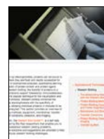
Western blotting overview