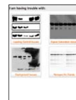
Troubleshoot western blots