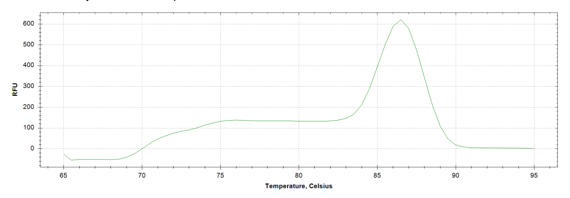
Melt curve analysis of above amplification