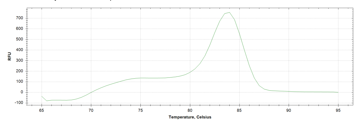
Melt curve analysis of above amplification