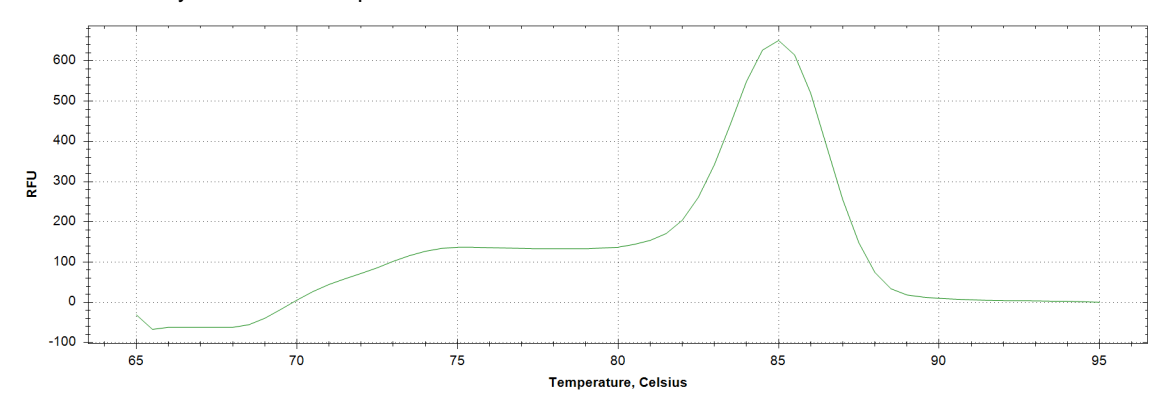
Melt curve analysis of above amplification