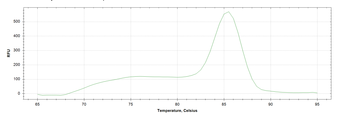
Melt curve analysis of above amplification