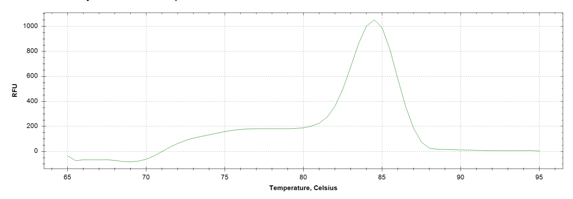
Melt curve analysis of above amplification