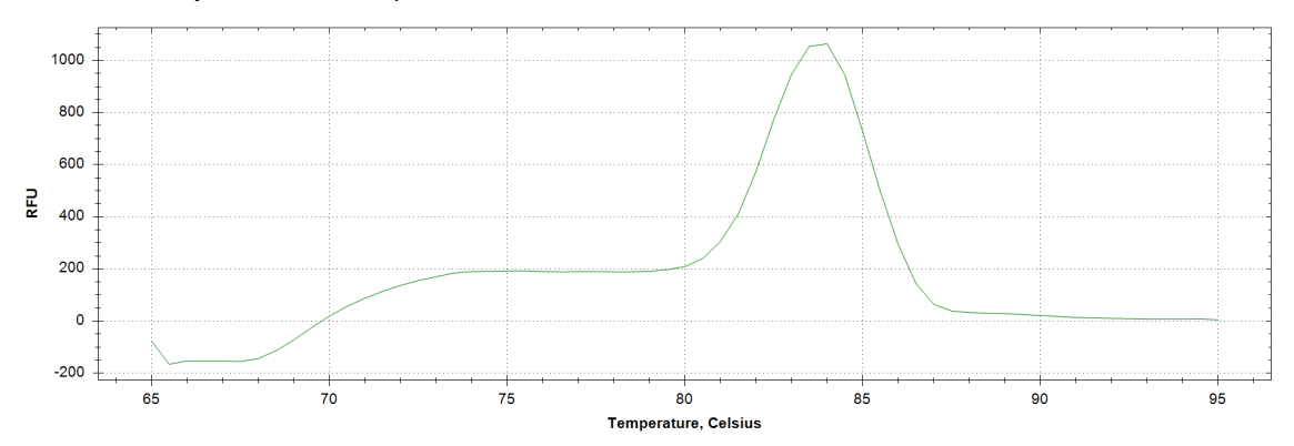
Melt curve analysis of above amplification