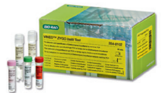
VINEO™ ZYGO bailii Test

For more information visit us on the web at www.foodscience.bio-rad.com