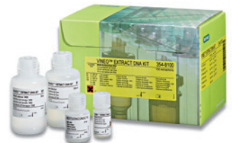
VINEO™ Extract DNA Kit