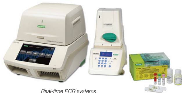
Real-time PCR systems and iQ-Check Campylobacter kit