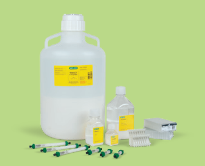
Process purification bottles, columns, and plates.